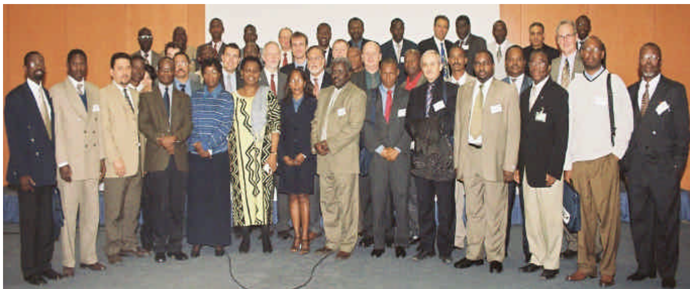
Participants at the regional consultative workshop