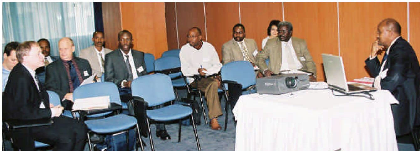
Eastern Africa - sub-regional group discussions